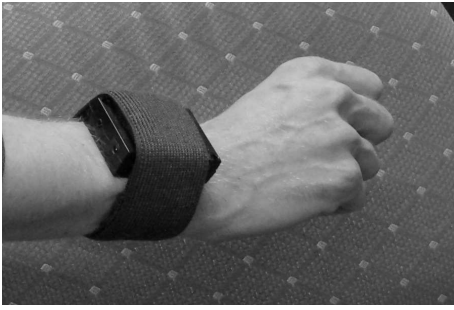
Fig. 1. Inertial measurement unit on the active wrist of a worker.