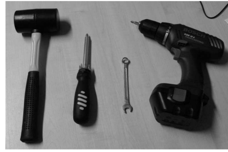
Fig. 2. Used tools: bumping mallet (hammer), screwdriver, spanner and power drill.

studies comparable to our approach mainly consider daily activities or sports. For example, good results have been achieved when using a triaxial accelerometer to recognize periods of sit-to-stand and stand-to-sit transitions and walking [4]. On the other hand, to recognize a more complicated set of movements, the amount of inertial measurement units has been increased; in [5] five biaxial accelerometers were attached to the hip, wrist, arm, ankle and thigh.